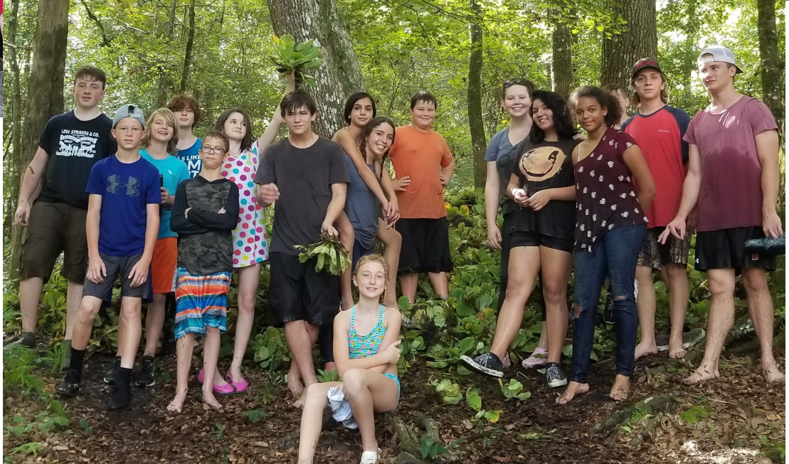
Top: Gopher tortoise burrow mapping at Ichetucknee. Middle Left: Fort White Christmas Parade. Middle Right: Preparing for Spooky Springs. Bottom: Removing invasive water lettuce from the Ichetucknee River.